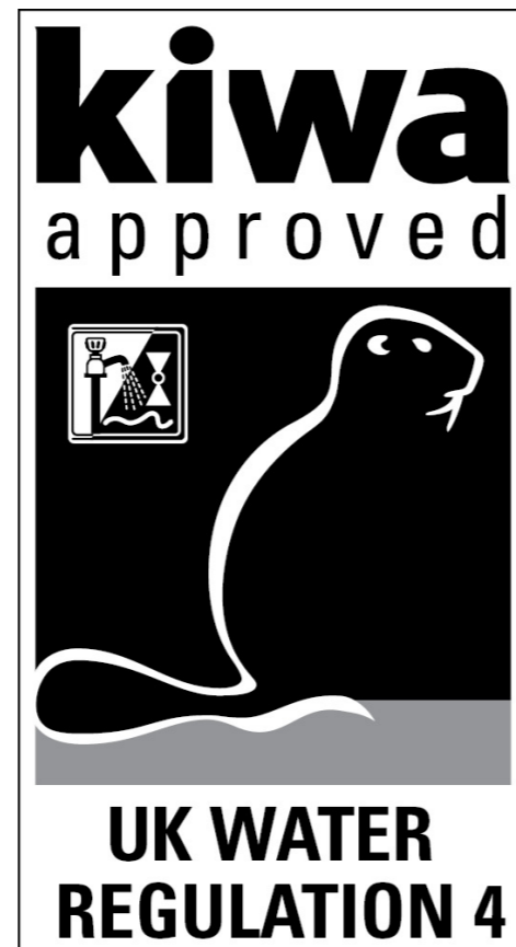
The KUKreg4 Certification Mark

Additionally, using the KUKreg4 Mark demonstrates that you have achieved independent third-party certification, providing your customers with confidence in your products and differentiating those products from market competitors.